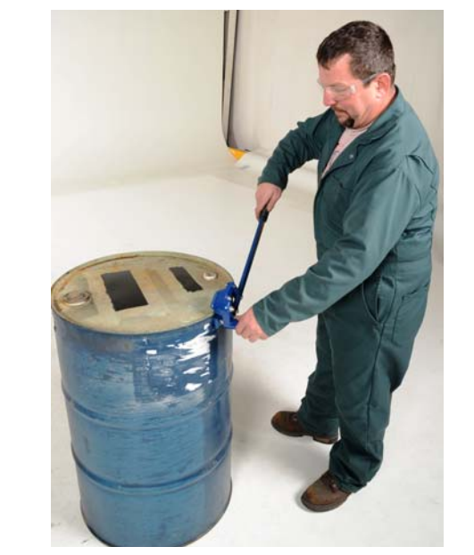
<u>Step 6</u>: Raise the handle and slide the deheader forward. Repeat steps 4-6 until the drum lid is adequately or fully opened.

<u>Step 4</u>: Firmly grasp the adjustment stem and press the handle down to pierce the drum lid.