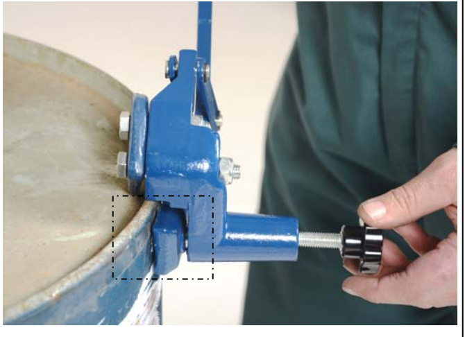
Turn adjustment knob until rim catch firmly contacts

<u>Step 3</u>: Turn the adjustment knob clockwise until the rim catch contacts the side of the drum (inside dashed box). Do not over tighten the adjustment knob. The deheader should be able to slide along the rim of the drum.